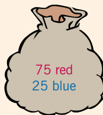
Bag x Total = 100 marbles

Ms. Rhee’s math class was studying statistics. She brought in three bags containing red and blue marbles. The three bags were labeled as shown below: