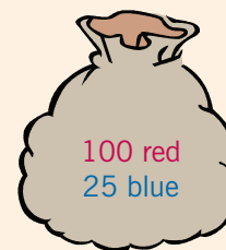
Bag z Total = 125 marbles

Ms. Rhee shook each bag. She asked the class, “If you close your eyes, reach into a bag, and remove 1 marble, which bag would give you the best chance of picking a blue marble?”