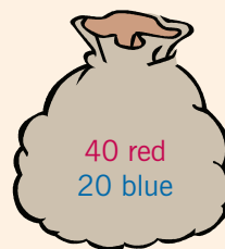
Bag y Total = 60 marbles